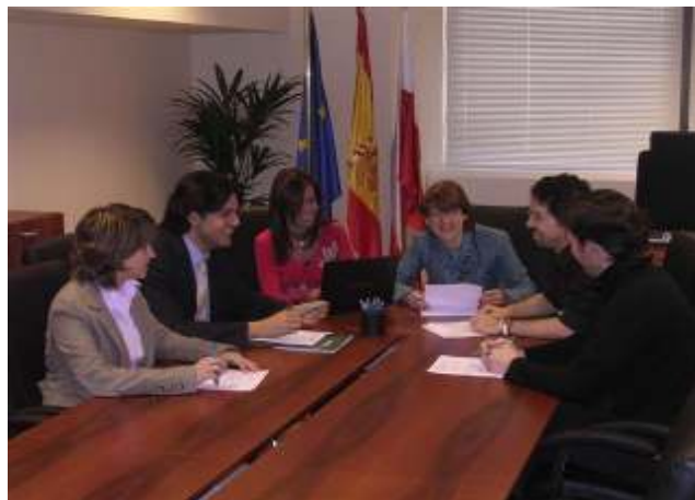
Staff of the SODERCAN office in Brussels in their meeting room

Key desk officers of the European Commission offered the latest information on the 7 th Framework programme for Research, on the Competitiveness and Innovation Programme and on the new ERDF Territorial Co-operation objective (former INTERREG).